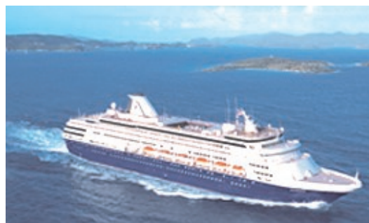
Holland America Veendam